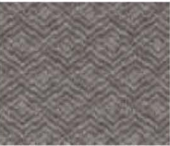
Medium Graphite Cloth