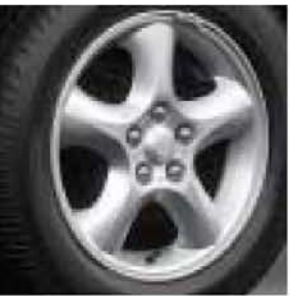
16" Painted Aluminum Wheel Standard on SE and SES