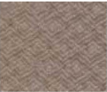
Medium Parchment Cloth