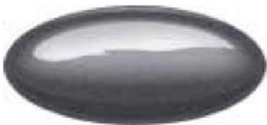
Dark Shadow Grey Metallic