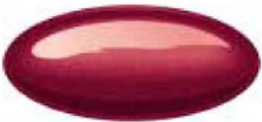
Matador Red Metallic