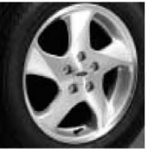
16" Aluminum Sport Wheel Standard on SES Sport Package