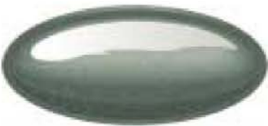
Spruce Green Metallic