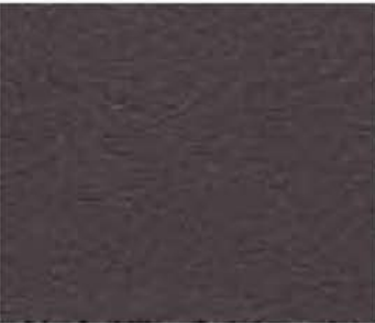
Dark Charcoal Leather