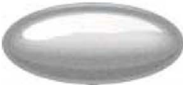
Silver Frost Metallic