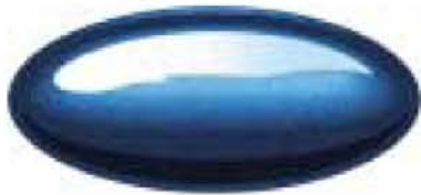
Patriot Blue Metallic