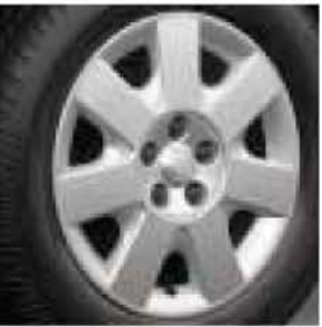
16" Steel Wheel Standard on LX