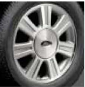
16" Machined-Aluminum Wheel Standard on SEL