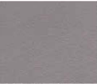
Medium Graphite Leather