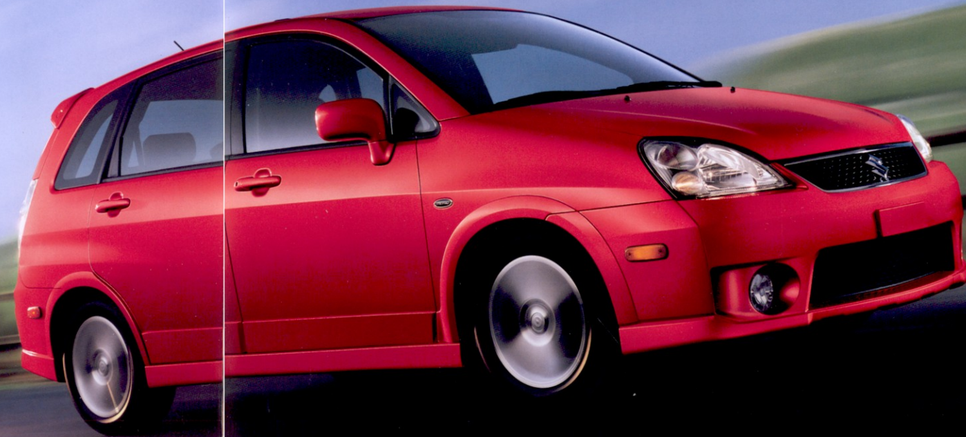
Aerio SX shown in Racy Red.

Somehow, somewhere, more personality, more power, a get-real attitude and a whole lot more fun has crept into the universe. And it's out there just for the taking. Will the entire population figure this out? Who cares? The new 155-hp Aerio. Bring it on.