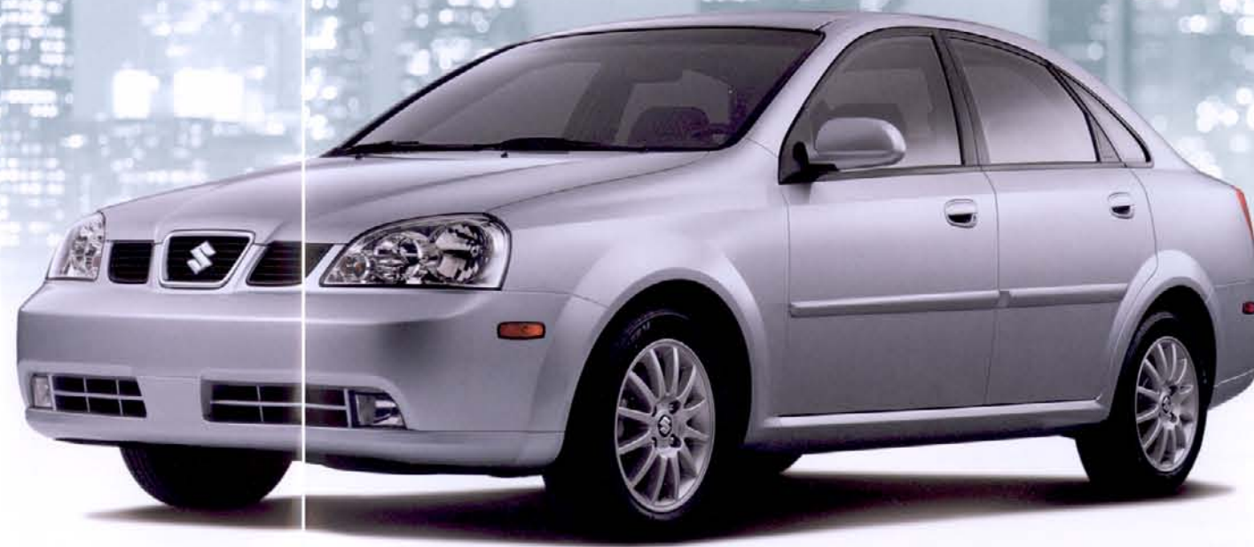
Forenza EX Sedan shown in Titanium Silver Metallic.